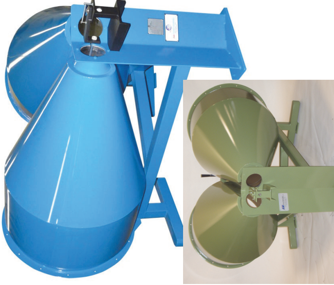
Semi-rigid foam with sheet metal shell layer reduces excessive noise.